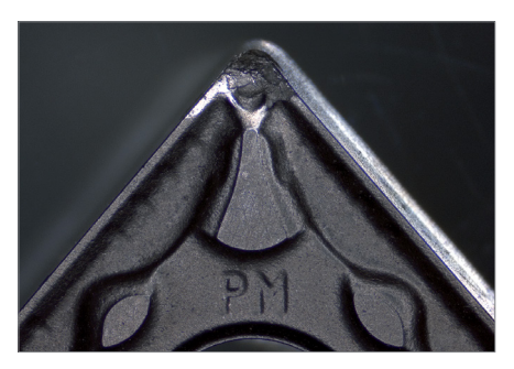
Indexable insert, shows tool wear. Reflected light, ringlight, zoom 0.8×