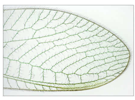
Green lacewing Transmitted light brightfield